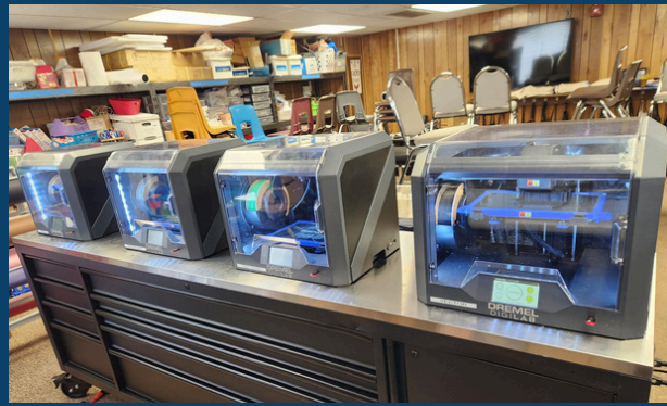
John Hancock Charter School