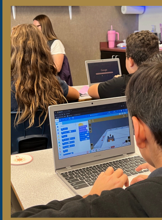
American Leadership Academy