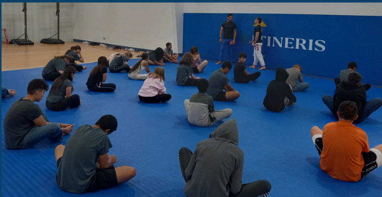
Itineris Early College High School