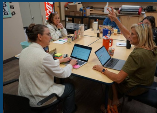
Ascent Academies of Utah