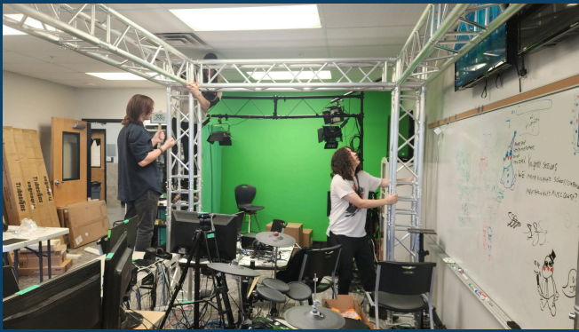
Merit College Preparatory Academy

The SCSB encourages all schools to submit their innovative successes to the Charter Insights page where they can be shared with the greater community. https://ucap.schools.utah.gov/CharterInsights/CharterInsights